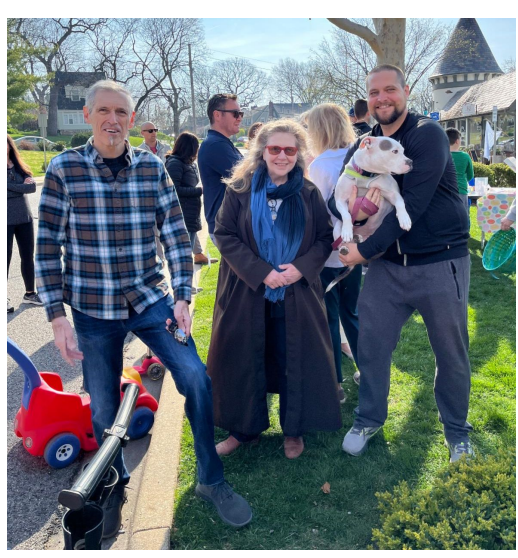
Congratulations to 2005 West 50th St. for the April YOTM!